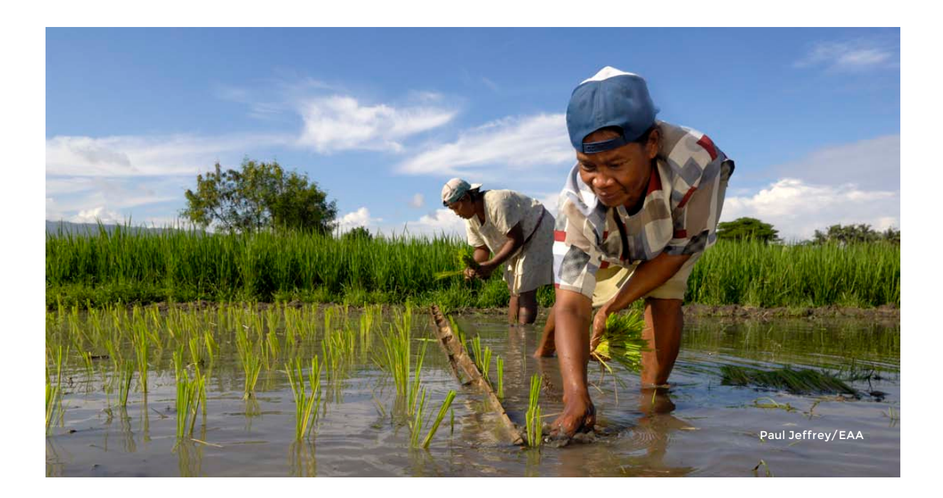
Table 2. A set of guiding questions to assess if proposed agricultural systems are contributing to sustainable livelihoods I. Are they reducing poverty? 2. Are they based on rights and social equity? 3. Do they reduce social exclusion, particularly for women, minorities and indigenous people?

4. Do they protect access and rights to land, water and other natural resources?